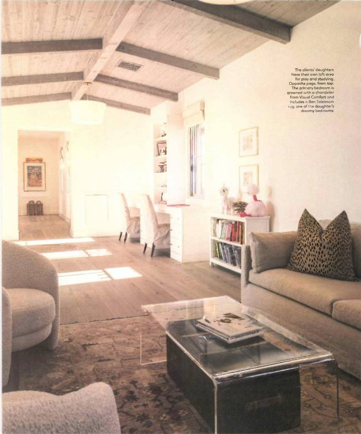
The clients' daughters have their own loft area for play and studying. Opposite page, from top: The primary bedroom is crowned with a chandelier from Visual Comfort and includes a Ben Soleimani rug; one of the daughter's dreamy bedrooms.