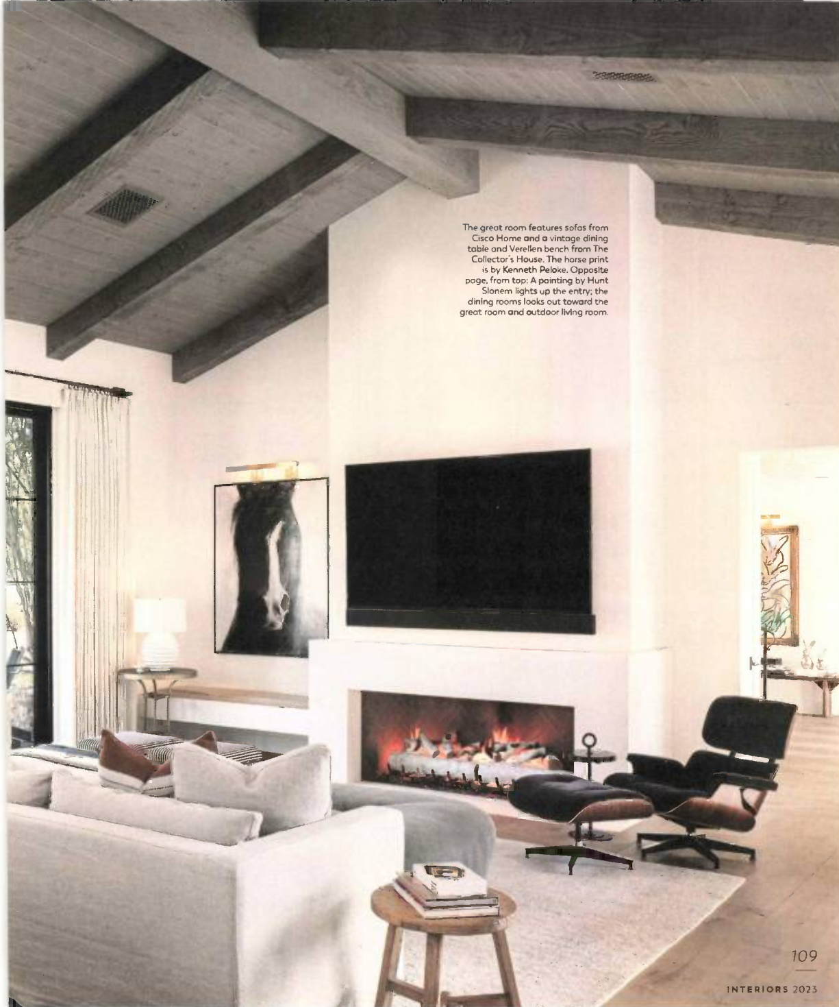
The great room features sofas from Cisco Home and a vintage dining table and Verellen bench from The Collector's House. The horse print is by Kenneth Polke. Opposite page, from top: A painting by Hunt Slonem lights up the entry; the dining room looks out toward the great room and outdoor living room.