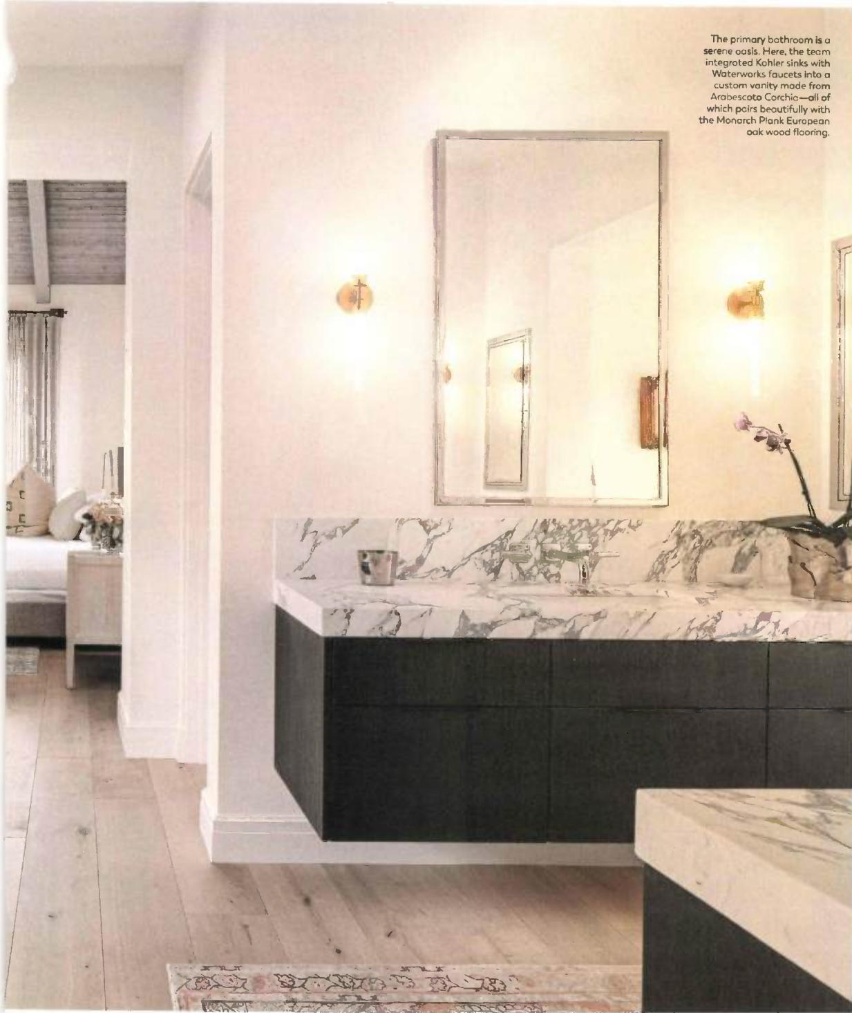
The primary bathroom is a serene oasis. Here, the team integrated Kohler sinks with Waterworks faucets into a custom vanity made from Arabescoto Corchia—all of which pairs beautifully with the Monarch Plank European oak wood flooring.