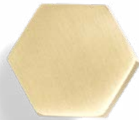
Hex and Stone knobs, made in a variety of finishes, from $20. ashleynorton.com .