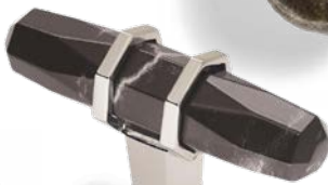
Carrione Knob by Amerock, produced in multiple finishes, $16. homedepot.com .