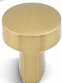
Hartridge Knob , available in several finishes, $9. topknobs.com .