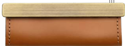
Contemporary Leather and Metal Recessed Pull , available in two colors, to the trade. richelieu.com .