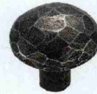
MANZONI Solid Pewter Knob / manzoni.us

THE KAREN SINK BASE PROVIDES AN ELEGANT BACKDROP FOR SCULPTURAL HARDWARE.