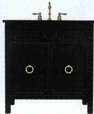
J. TRIBBLE Customizable to any width, depth or height, the classic Karen sink base instantly elevates the bath. Endless hardware options complement any look. All pieces shown above are also available through J. Tribble. jtribble.com