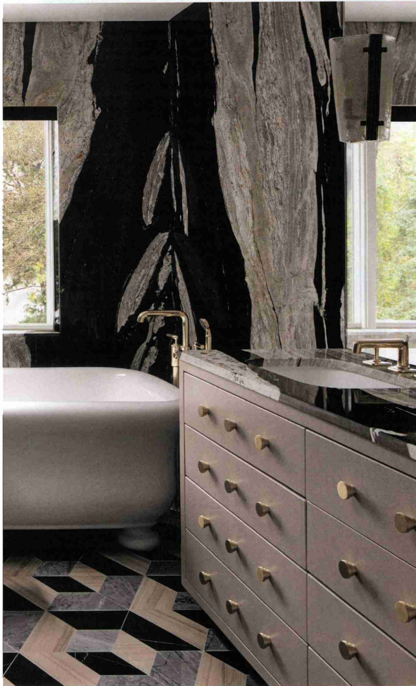
A Waterworks bathtub sits next to the vanity painted in Benjamin Moore's Hot Spring Stones. Arteriors sconces complement the Black Horse marble slabs on the walls.