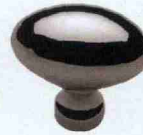
ASHLEY NORTON Carlisle Knob in Polished Nickel