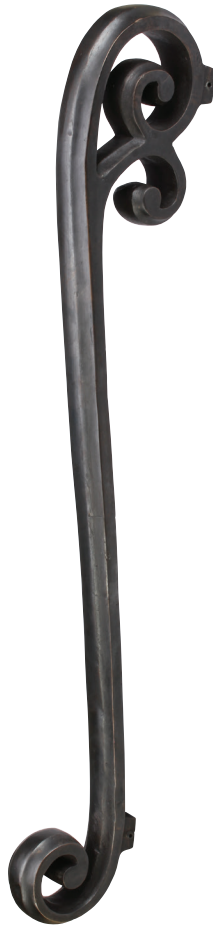
1370 Pull 22" x 1 1/4" Projection: 4" CTC: 18" Shown in dark bronze patina For back to back pair, order 1370-BTB