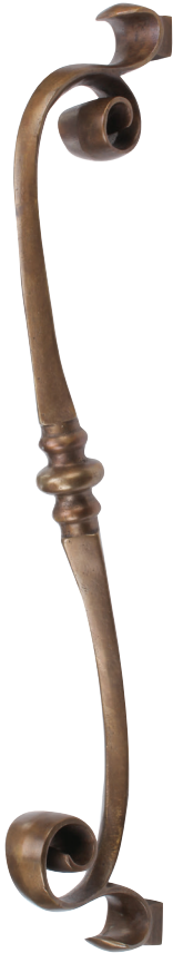
1360 Pull 21 1/4" x 1 5/8" Projection: 4 3/8" CTC: 20" Shown in light bronze patina For back to back pair, order 1360-BTB