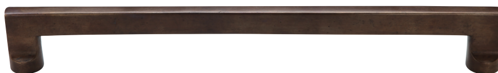
1450 Apollo Pull