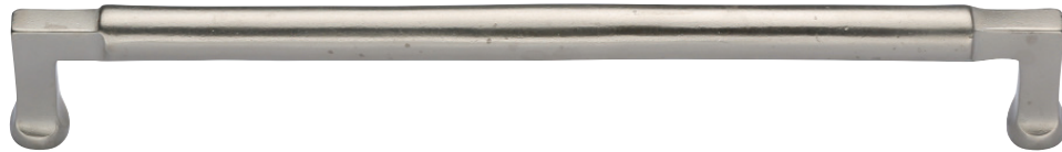
1312 Bauhaus Pull