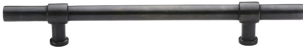
1430 Bar Pull