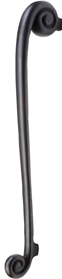
1380 Pull 21 3/4" x 1 1/4" Projection: 4" CTC: 18" Shown in dark bronze patina For back to back pair, order 1380-BTB

Maximum door thickness for Back-to-Back fixing: 2 1/2"