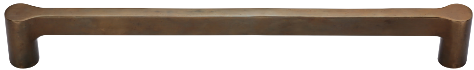
1348 Claros Pull