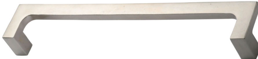
1383 Offset Urban Pull