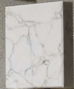
Arabetto , $75 to $125 per sq. ft., installed. caesarstoneus.com .

A new wave of options ensure a dimensional counter or backsplash.