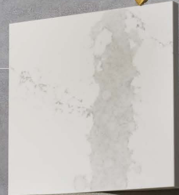
Calacatta Pastino , $90 per sq. ft. wilsonart.com .