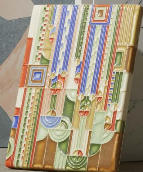
Saguaro in Rainbow, from the Frank Lloyd Wright Collection, $160 per tile. motawi.com .