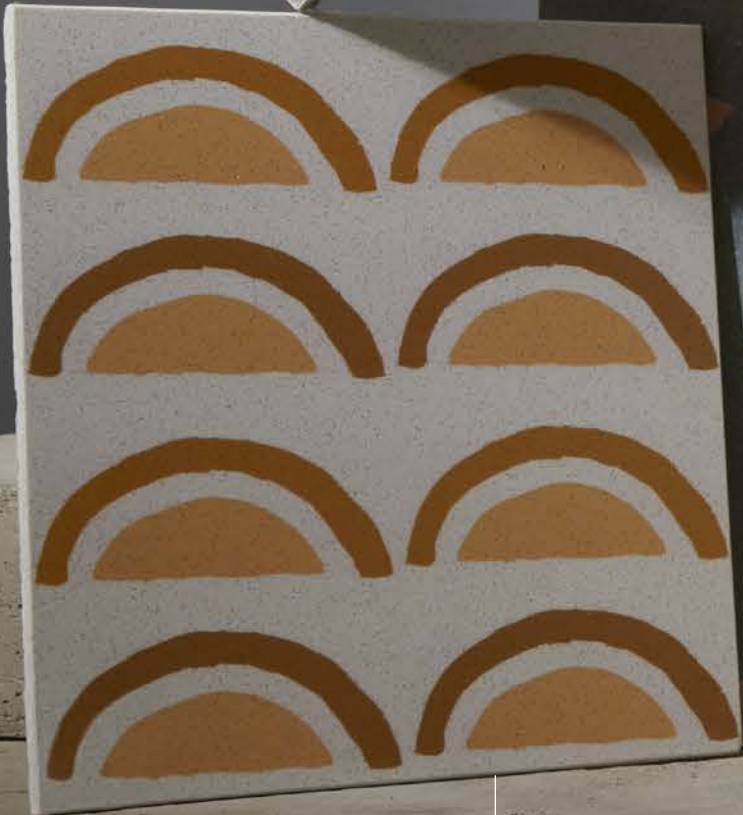
Deco Sol in Orange Dawn, $46. livden.com .