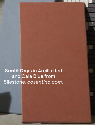
Sunlit Days in Arcilla Red and Cala Blue from Silestone. cosentino.com .