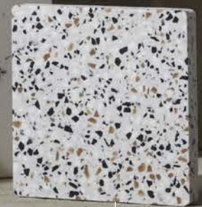
Dalmata Terrazzo Matrix . formica.com