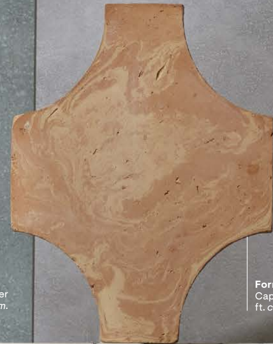
Fornace Brioni Cotto Capriccio , $60 per sq. ft. cletile.com .