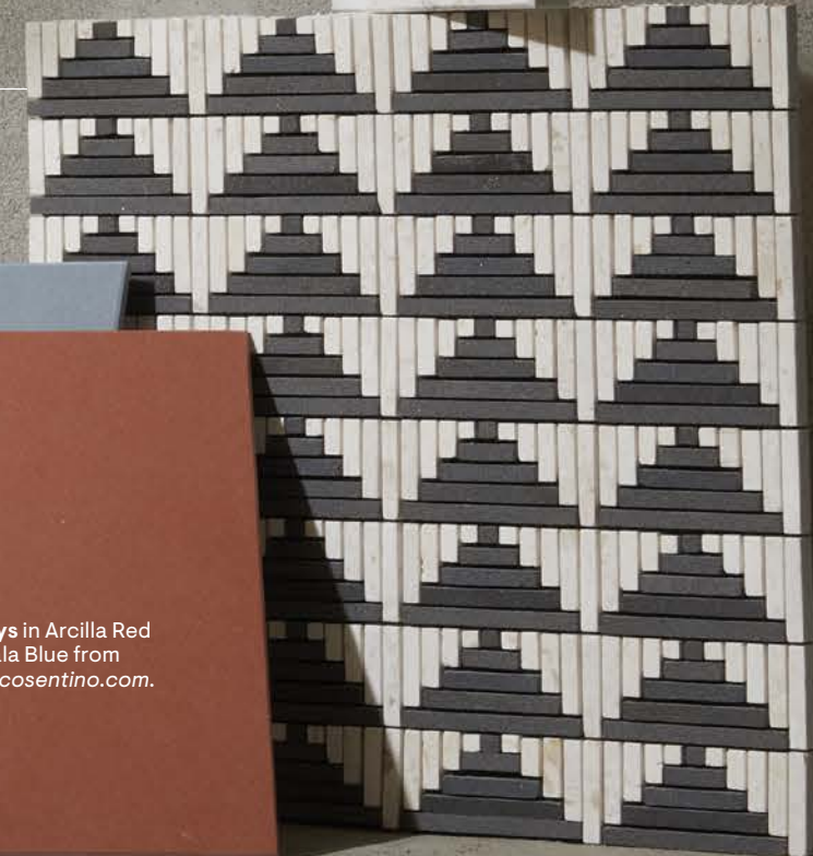
Koros Gao in Myra Beige and Basalt, $80 per sq. ft. annsacks.com .