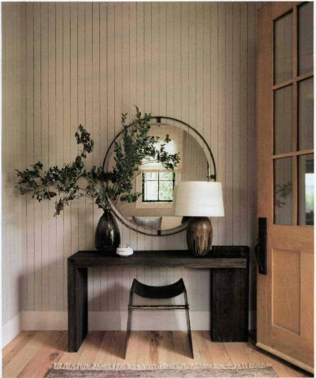
The entry balances materials including a Noir console with a custom finish, an iron-and-brass Arteriors stool and a stoneware lamp by Victoria Morris Pottery. Beadboard walls painted Benjamin Moore's Revere Pewter nod to local farmhouse design. The mirror is from Audo Copenhagen.