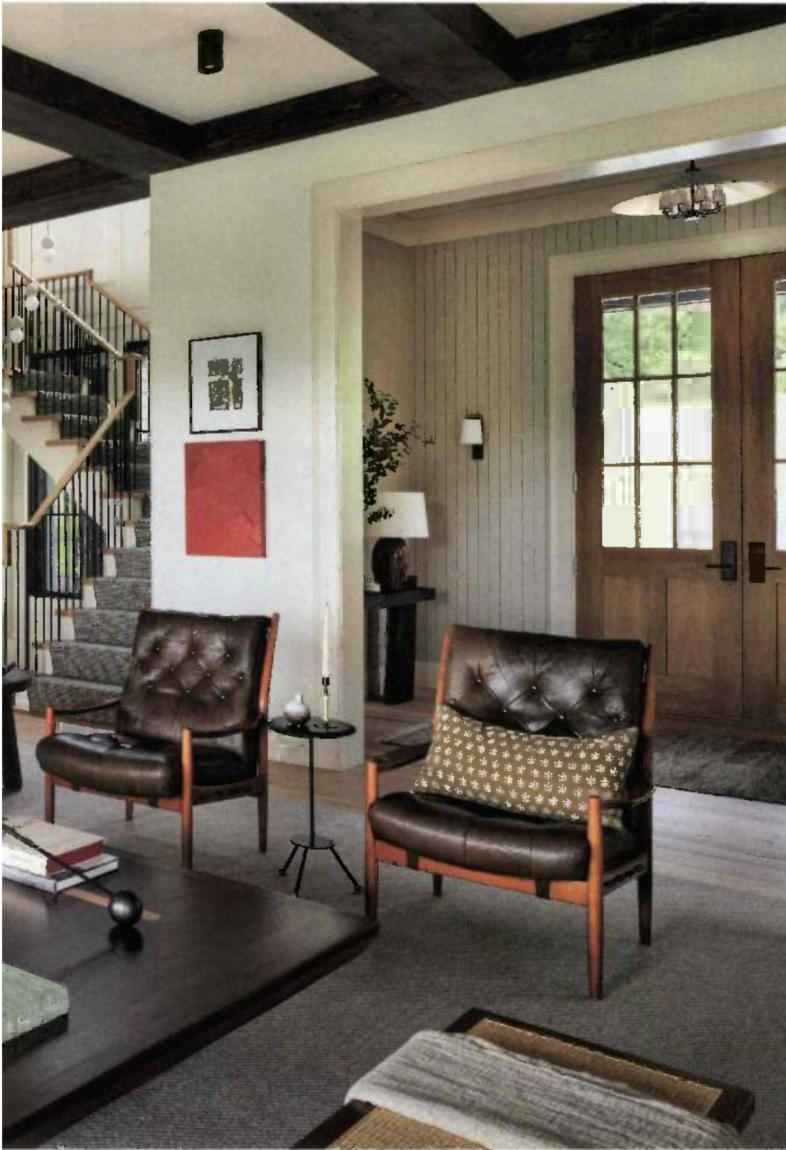
In the living room, the Jean Michel Frank-style sofa clad in a Romo fabric joins French club chairs from Istdilbs updated with leather lining by Falodco Studios. Antieris lamps top wood side tables from Lucca Antiques and the coffee table is a vintage piece.