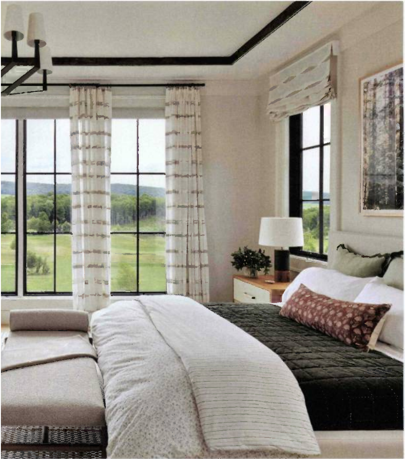
Sumptuous textures, including shearling-covered chairs by Anderssen & Voll and a hand-loomed floor covering by Loloi Rugs, define the primary bedroom. A chandelier by Thomas O'Brien for Visual Comfort & Co. hangs above, while curtains of a Romo fabric frame postcard views.