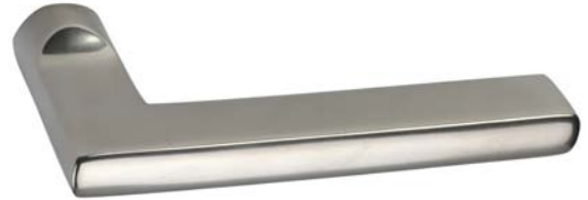
Apollo (450) lever 5" length Shown in white bronze patina