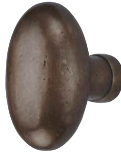
Carlisle (660) knob 2 5/8" x 1 1/2" Shown in light bronze patina