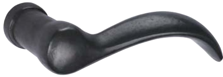
Churchill (500) lever 4 5 / 8 " length Shown in dark bronze patina