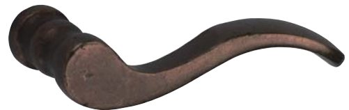
Chester (200) lever 4 9 / 16 " length Shown in light bronze patina