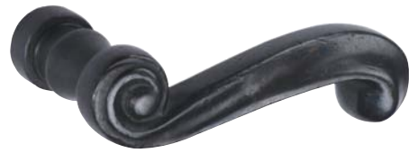
Chiltern (160) lever 4 7 / 16 " length Shown in dark bronze patina