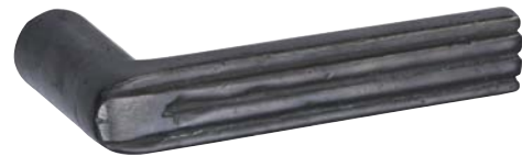
Adonis (985) lever 4 3/4" length Shown in dark bronze patina