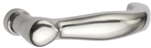
Hampton (400) lever 4 3 / 4 " length Shown in white bronze patina