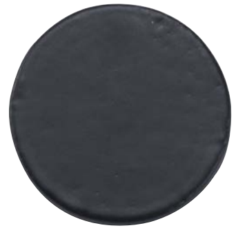
Matt Black (TC)