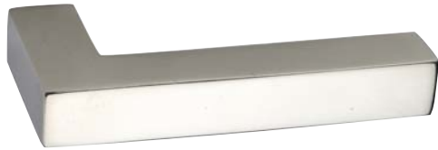
Greenwich (350) lever 4 3/4" length Shown in white bronze patina Not recommended for use with multipoint locks