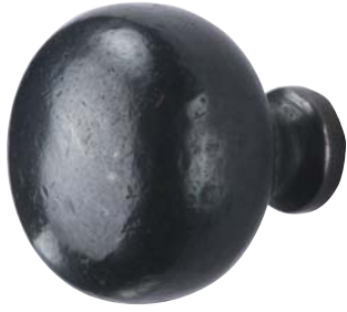
Windsor (900) knob 2 1/4" dia Shown in dark bronze patina