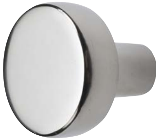
Helios (880) knob 2 1/4" dia Shown in white bronze patina