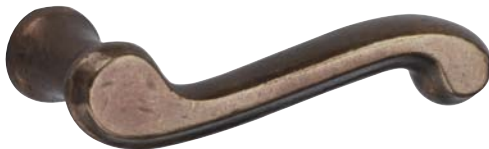
Shropshire (800) lever 4 3 / 4 " length Shown in light bronze patina