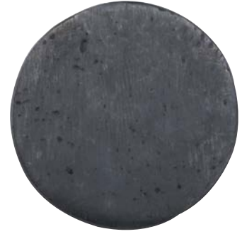
Dark Bronze (BZ)

Ashley Norton applies a light coating of wax to protect our products from oxidization and wear. As the wax coating wears off, the patinas will be exposed to the environment. The effects of age, climate and touch will work in conjunction to create unique, contrasted color variations. The most frequently touched areas will highlight as the patina wears off and natural shades of bronze are exposed. Areas which are not handled may oxidize further, and the combination of colors and hues will accentuate the timeless elegance of bronze.