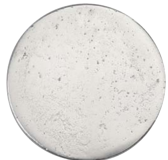
White Bronze (WL)