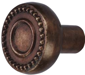
Pearl (970) knob 2 1/4" dia Shown in light bronze patina