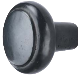
Newport (990) knob 2 1/4" dia Shown in dark bronze patina