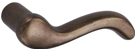
Elm (580) lever 4 11 / 16 " length Shown in light bronze patina