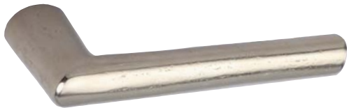
Atlas (375) lever 4 7/8" length Shown in white bronze patina Not recommended for use with multipoint locks