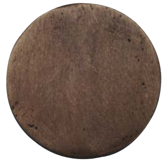
Light Bronze (LT)