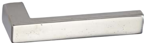
Meridian (310) lever 4 7/8" length Shown in white bronze patina