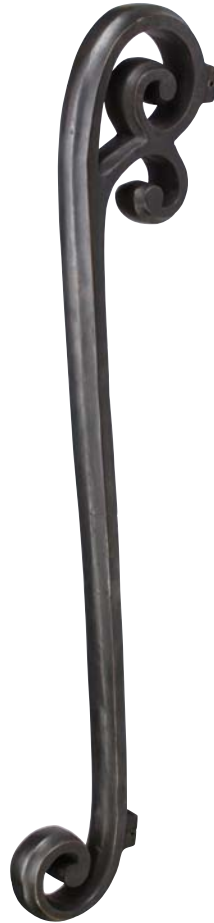
1370 Pull 22" x 1 1/4" Projection: 4" CTC: 18" Shown in dark bronze patina