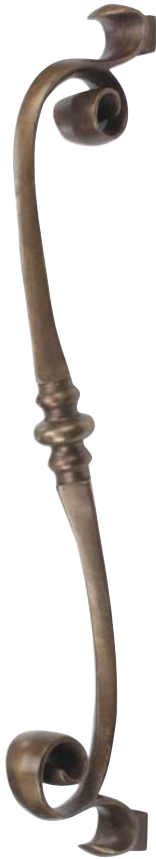
1360 Pull 21 1/4" x 1 5/8" Projection: 4 3/8" CTC: 20" Shown in light bronze patina